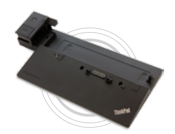
Ultra Dock Docking Station